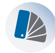
Extensive Colour Options